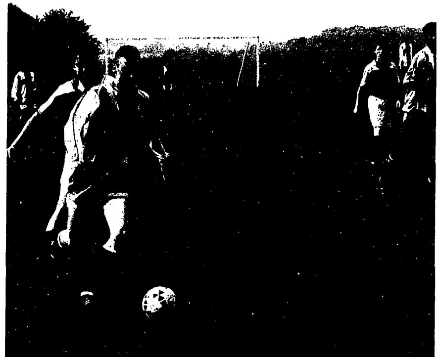
Lincoln's exciting 4-0 soccer game win added to the festivities of Homecoming '92.