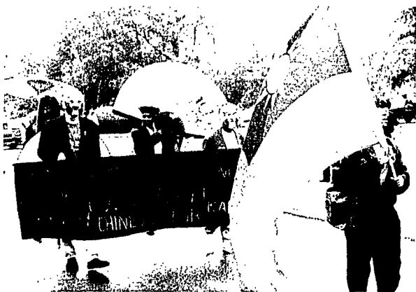
The Chinese Club marches in the 1992 Homecoming Day Parade.