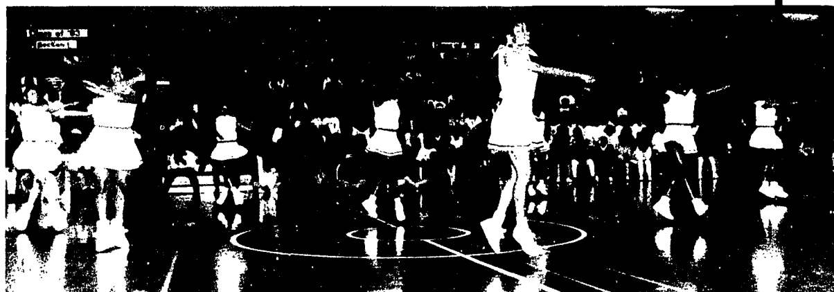
Lincoln University Cheerleaders demonstrated vim, vigour, and that "Old Lincoln Spirit" at the Homecoming '92 Pep Rally.