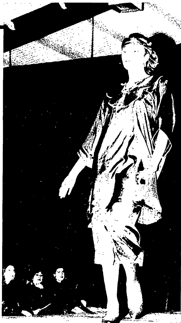
A Lincoln student models a shiny new outfit at the Homecoming '92 Fashion Show.